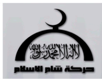
Sham al-Islam Movement