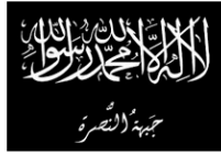
al-Nusra Front (al-Qaeda)