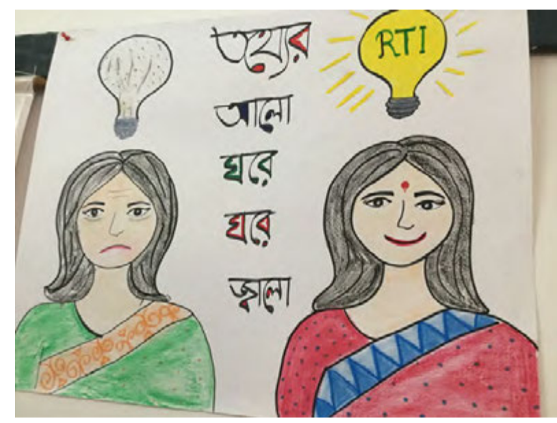
A poster drawn during RTI Boot Camp, demonstrating the power of access to information for women.

Finally, MRDI conducted awareness raising sessions in four schools, two each in Dhaka North and South, reaching a total of 465 female students. The awareness raising activities ensured that the students understood the right of access to information and culminated in a quiz competition with a small prize ceremony with the Chief Information Commissioner in attendance.