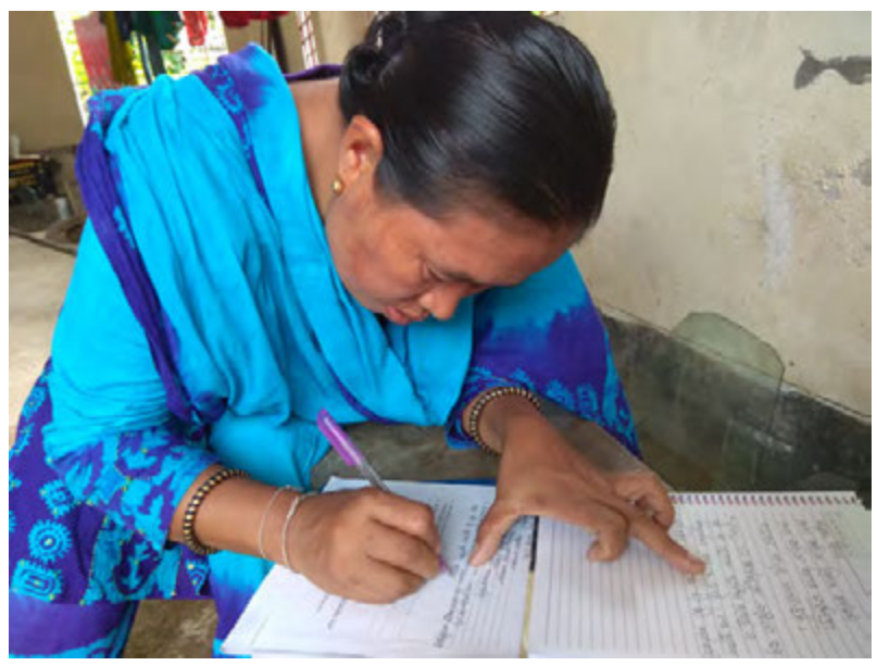
With guidance from the Center's Tottho Bondhu, a woman copies her notes from a courtyard meeting onto the request for information form.

information, the combination of the courtyard meetings and support of the Tottho Bondhus has resulted in more frequent and successful requests for information, which also is appreciated by local government ministries as critical information flows to women.