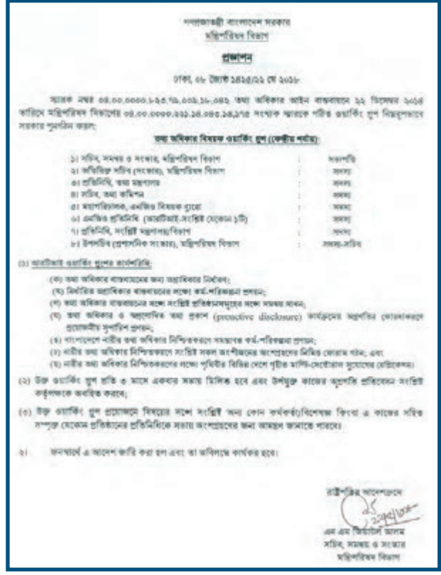
Circular issued by the Government of Bangladesh, reinvigorating the RTI Working Groups and including gender in their agenda.

Initially, The Carter Center proposed the development of a national and district-level multi-stakeholder working group to help consider the issues facing women and propose solutions to overcome the legal and social challenges. However, a national RTI working group (RTI WG), led by the Cabinet Division and comprised of a number of government ministries, and district advisory committees already existed, but were not fully functional. Rather than duplicate existing bodies,