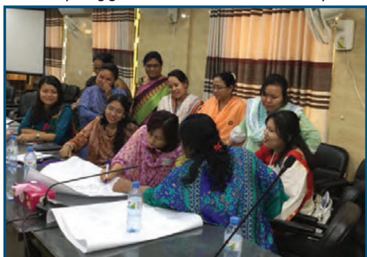
Female participants complete an exercise during an event in Khagrachari to identify and highlight gender biases.

both the national and local level governments are integral to responding to women's information needs, the Center and our partners worked at both levels. In addition to working closely with the Cabinet Division to support activities in the field, the Center also conducted gender sensitization and awareness raising activities in Dhaka with high level members of those ministries identified as most relevant to women's information needs including the Ministry of Agriculture Education, Land, Primary and Mass Education, Women and Children's Affairs and others. In Khagrachari and Sylhet, the Center provided similar awareness-raising sessions for members of the RTI working groups, as well as day-long gender sensitization events for key civil servants, ensuring that they were better