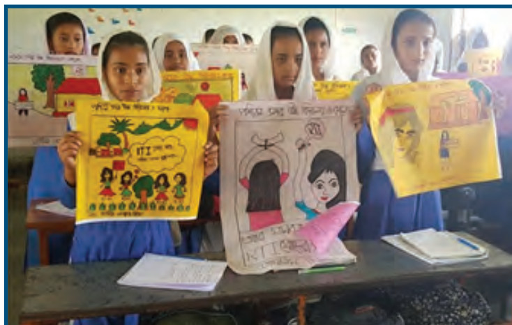
Female students pose with their poster designs in Sylhet.

The 2015 study on women and access to information identified the perception that there are groups/individuals in Bangladesh that are more encouraging of women's access to information and others that are less supportive. To raise awareness of the value of women's access to information for the family and community, as a means of influencing those persons identified as obstacles, the Center worked with the Information Commission, RTI Working Groups, and school children in Khagrachari and Sylhet to come up with the elements of a targeted awareness raising campaign. For example, in coordination with the Information Commission, Deputy Commissioner of Sylhet, and the RTI WGs of all four administrative levels in Sylhet, the Center held a half-day meeting for the RTI WG members in Sylhet, which included opening remarks from Chief Information