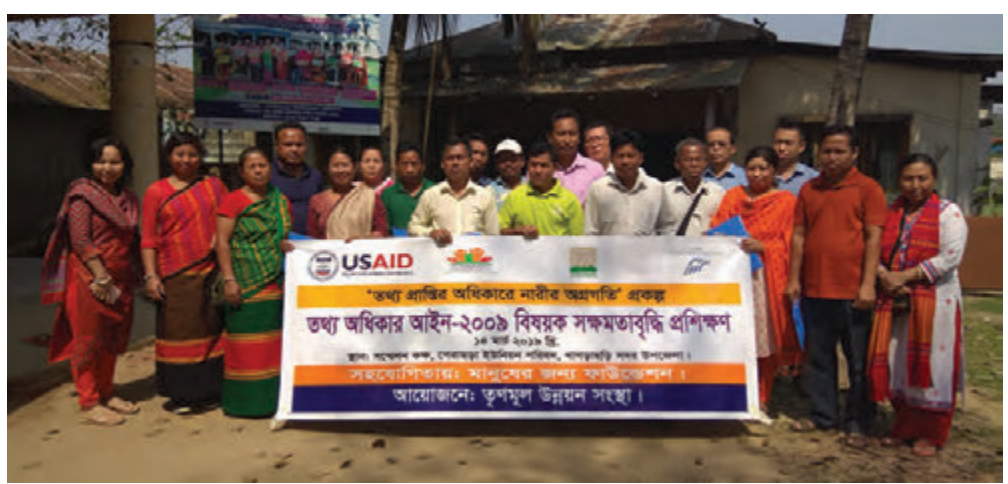
Members of the Perachara Union Parishad pose with a program banner after participating in a capacity development event led by TUS.

professionally perceive the importance of women's right of access to information. One-day refresher trainings were conducted in the months following the original two-day trainings, to ensure that participants recalled what they had learned, answer questions that had arisen since the initial training, and support the application of the training into their daily work. At the local level in Khagrachari and Sylhet, IDEA and TUS conducted capacity development work related to the right of access to information with members of union parishad bodies. These trainings included