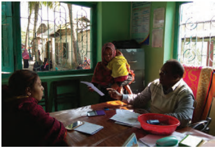
Wiith the assistance of the Center's Tottho Bondhu, a woman in Sylhet submits a request for information.

Before the Tottho Bondhus, there were very few information requests from women, particularly those living in the most rural or destitute areas. With the support of the "information friends" hundreds of women have been able to receive transformative information. In both Khagrachari and Sylhet, the increase in women requesting information has created a sense of enthusiasm beyond the individuals, encouraging others in the community and the local government officials. Whereas women used to struggle to employ the means of seeking