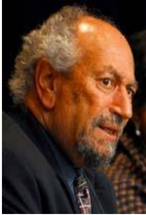
Dr. Saad Ibrahim Egypt

particular education, as the key to boosting civil liberties in Haiti and suggests using more interactive media to make education about humanitarian and civic issues more appealing. "We need to nourish the culture of life and democracy through all means possible," he says.