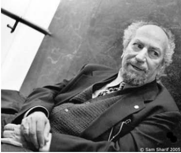
Dr. Saad Ibrahim Egypt

His call for democracy and human rights in the Middle East has risked his life and health, but Ibrahim's persistence continues to spark dialogue for advancement of democratic principles.