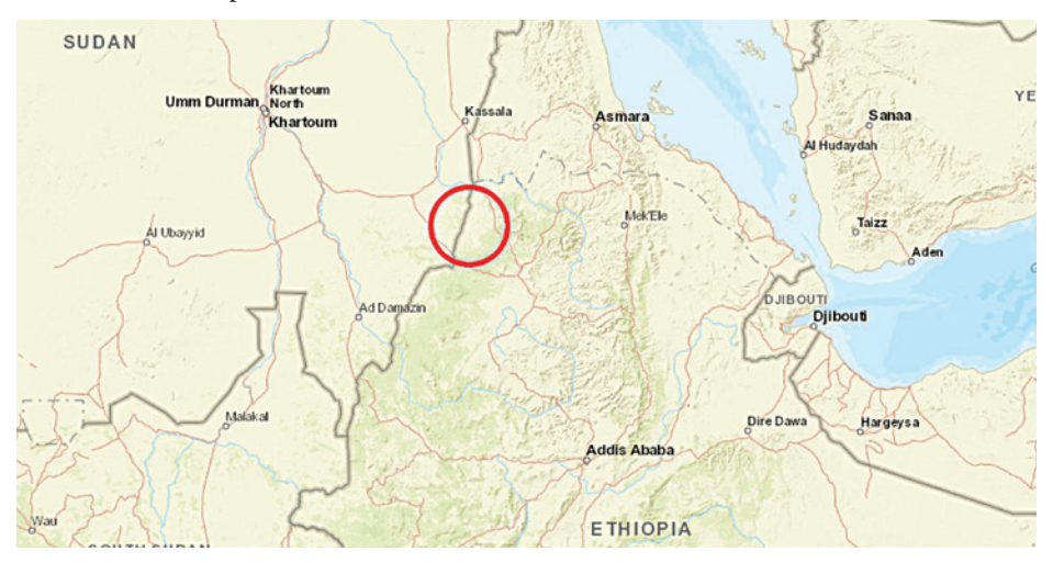
The Metema-Galabat focus, which straddles Ethiopia and Sudan, is poised to enter post-treatment surveillance.

attendance and determined that assessments had indicated the interruption of onchocerciasis transmission in a cross-border transmission zone (the Metema-Galabat focus). Based on World Health Organization guidelines, the committee recommended that mass drug administration could be stopped in a coordinated fashion in this cross-border focus in 2018. However, a very small portion of the focus in Metema, Ethiopia, still has an entomological "hot spot" of highly localized transmission that will continue to be treated with ivermectin. Coordinated