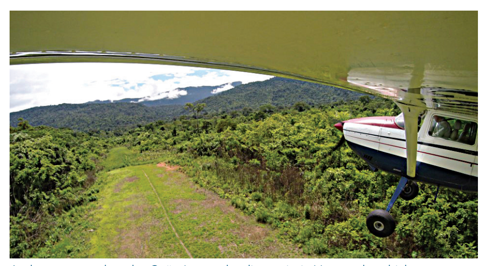
A plane approaches the Caño Iguana landing strip in Venezuela, which was cleared in May 2017, improving access to 452 people at risk of onchocerciasis.

The Venezuela South focus team reported on their efforts to rehabilitate old, overgrown landing strips to improve the program's reach. In some cases, the team has parachuted in with tools to clear a strip. Eight landing strips have been recovered to date, and two more are slated for 2018.