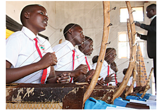
Students perform a song on traditional instruments during the Ugandan Music, Dance, and Drama Festival.

Of the 44 schools that reached the finals, nine were from trachomaendemic areas where The Carter