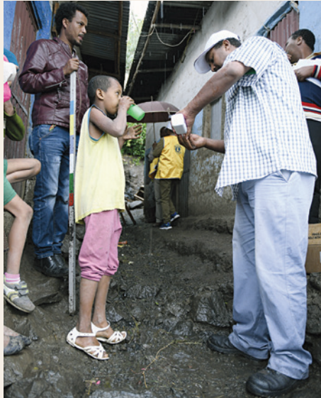
An Ethiopian child receives a dose of antibiotics to prevent the bacterial eye disease trachoma. Lions Clubs International supports the Center's trachoma work in Ethiopia, Mali, and Niger.

The Lions Clubs International Foundation is a key partner to The Carter Center, having provided more than $59 million in grants since 1994, leading to the distribution of over 214 million treatments for river blindness and over 175 million treatments for trachoma. More than 775,000 sight-saving trichiasis surgeries have been performed, and more than 3.2 million latrines have been built.