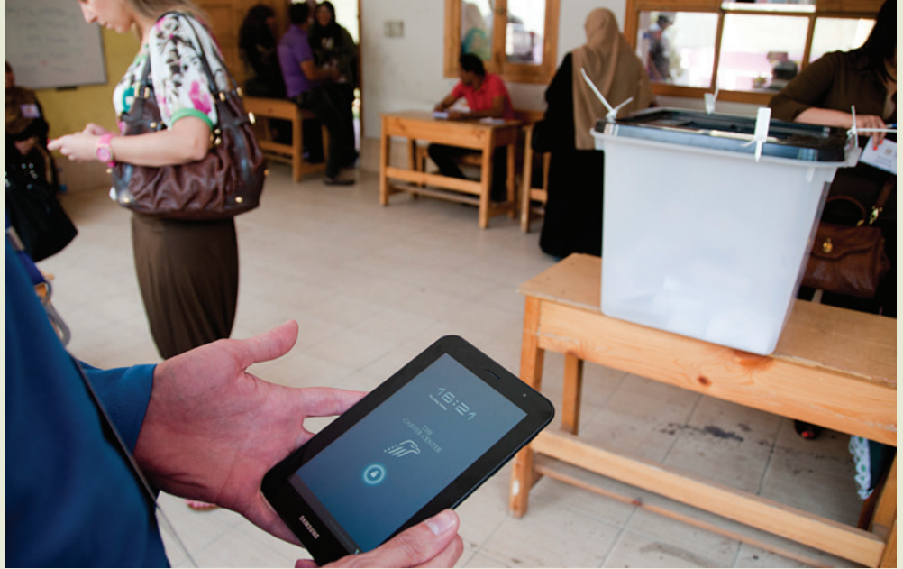
During recent elections in Zimbabwe, The Carter Center provided support to domestic election observers using ELMO software, shown here in use in Egypt. The open-source software was developed by the Center.

Although civil society and political parties enjoyed greater political freedoms than in past elections, the process was