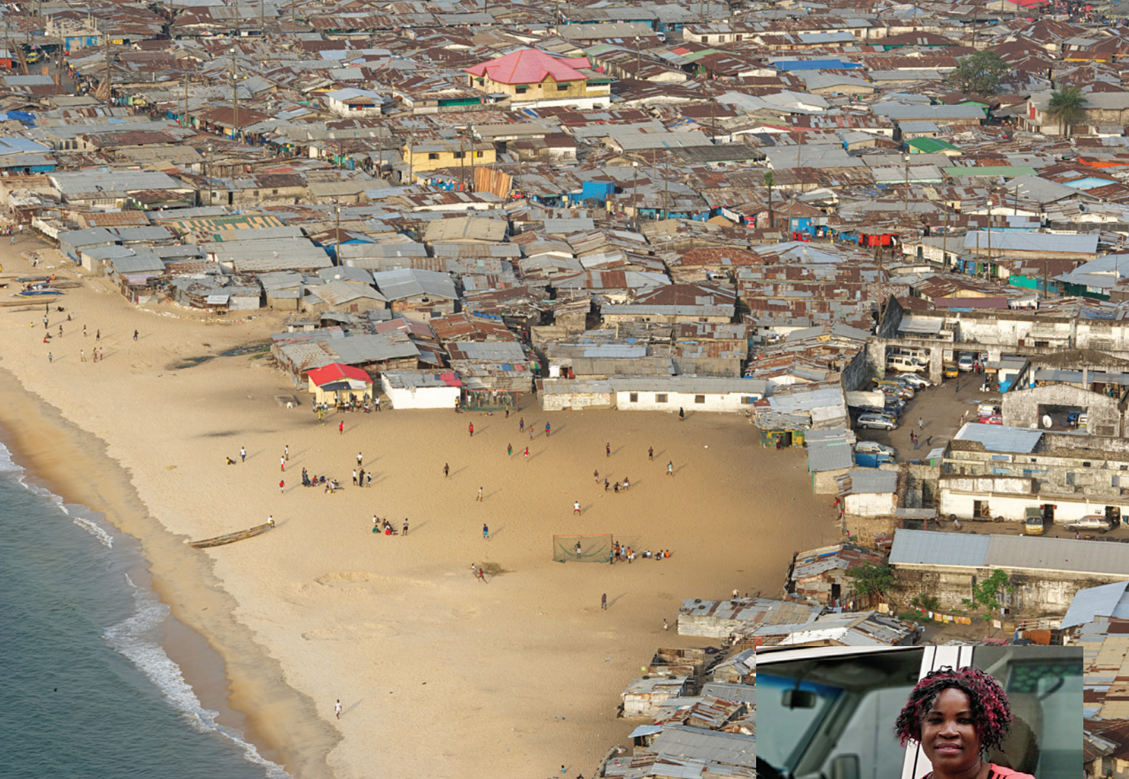
The crowded West Point township, located on a peninsula in Monrovia, Liberia, is one of the areas where The Carter Center has focused its urban work. The area is home to an estimated 75,000 people.