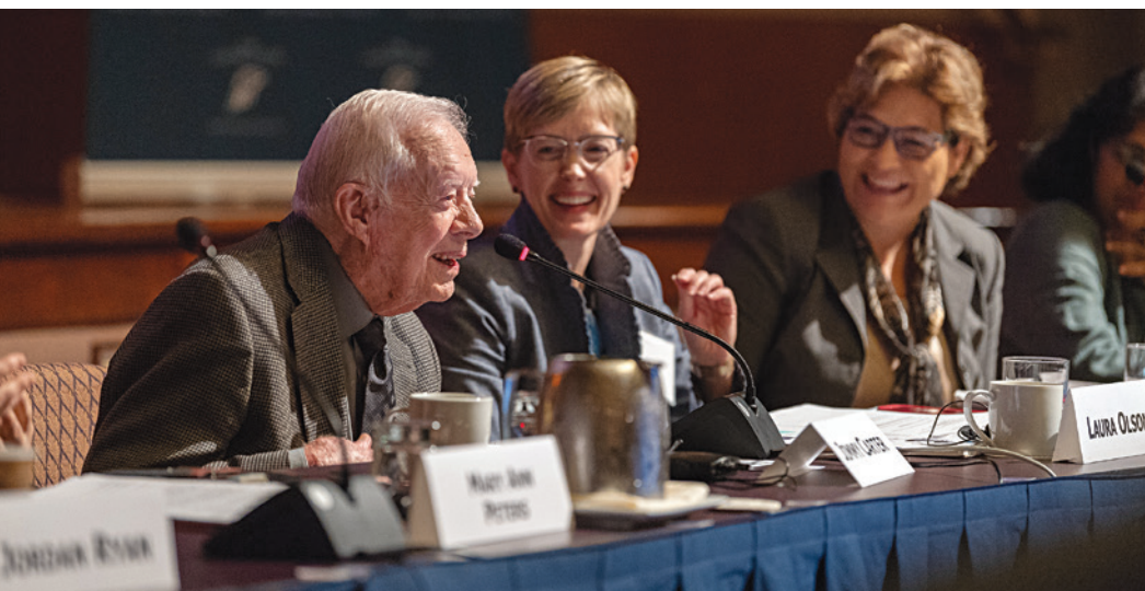
Former U.S. President Jimmy Carter shares his perspective with human rights defenders from around the world at a July conference hosted by The Carter Center.

Over time, we've been able to help them collaborate. And after seven years, we're starting to see a turning of the corner."