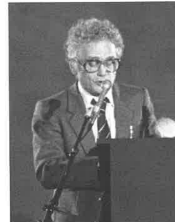
1986: Yuri Orlov, Soviet Union (co-recipient)

Yuri Orlov, Soviet physicist and dissident, has continued his important work as a human rights activist. Mr. Orlov serves as the honorary chair of and spokesperson for the International Helsinki Federation for Human Rights and has recently devoted himself to reestablishing the Moscow Helsinki Committee. The Committee, whose activities were forcibly curtailed in 1982, was founded by Mr. Orlov in May 1976.