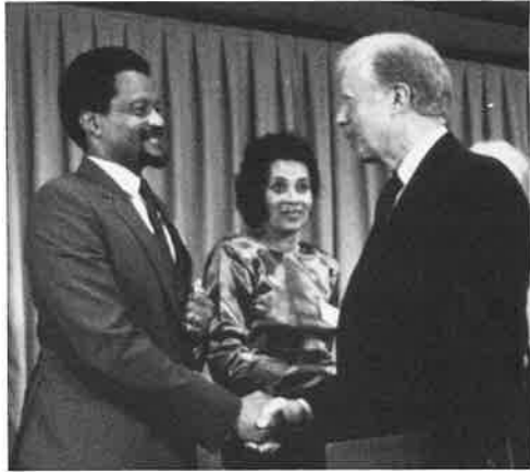
1988: The Sisulu Family, South Africa