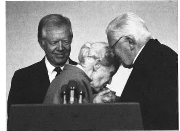
1987: La Vicariá de la Solidaridad, Chile

During the past two years, La Vicariá de la Solidaridad has persevered in its efforts to defend and promote human rights. The group's most important activities continue to be the protection of citizens' freedoms through the submission of habeas corpus petitions, the denunciation before the courts of violations of rights and abuses of power by agents of the military government, and the defense of persons accused of political crimes. In addition to its legal activities, La Vicariá continues to publicly denounce human rights violations by distributing monthly and yearly bulletins on the status of human rights in Chile.