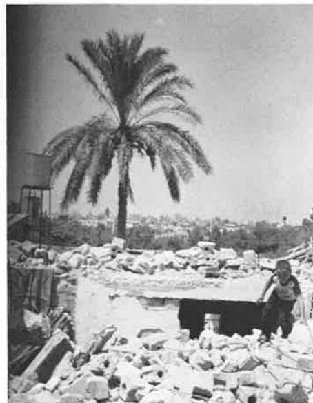
Al-Haq documentation of a house demolition in Shuja'iyyeh, Gaza, on July 17, 1989. No reasons were given by the authorities for the demolition.