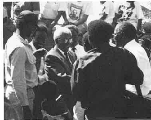
Walter Sisulu is reunited with his family after his release from prison on October 15, 1989. Human Rights Program staff await his arrival in Soweto with the Sisulu family.

1989 was a year of dramatic changes for the Sisulu family. The most notable was the unconditional release on October 15 of Walter Sisulu, who was serving the 26th year of a life sentence for his leadership in the banned African National Congress (ANC). Also in October, restriction orders making Albertina Sisulu a prisoner in her own home for the better part of 25 years were lifted. The Sisulus attribute these changes to intensifying internal and external pressure on the South African government to negotiate with credible black leaders.