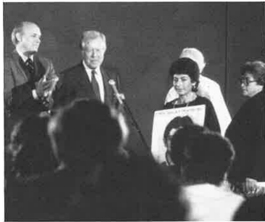
1986: Grupo de Apoyo Mutuo, Guatemala (co-recipient)

In Guatemala, few families are untouched by violence and loss. Because GAM remains in special need at present, its members ask that the international community urge the government and security forces to comply with universally held standards of human rights to end the violence to which Guatemalans are daily subjected.