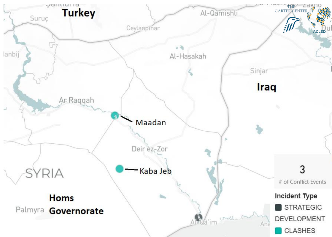
Figure 4: Incidents related to pro-government infighting between 15-21 February 2021. Data from The Carter Center and ACLED.