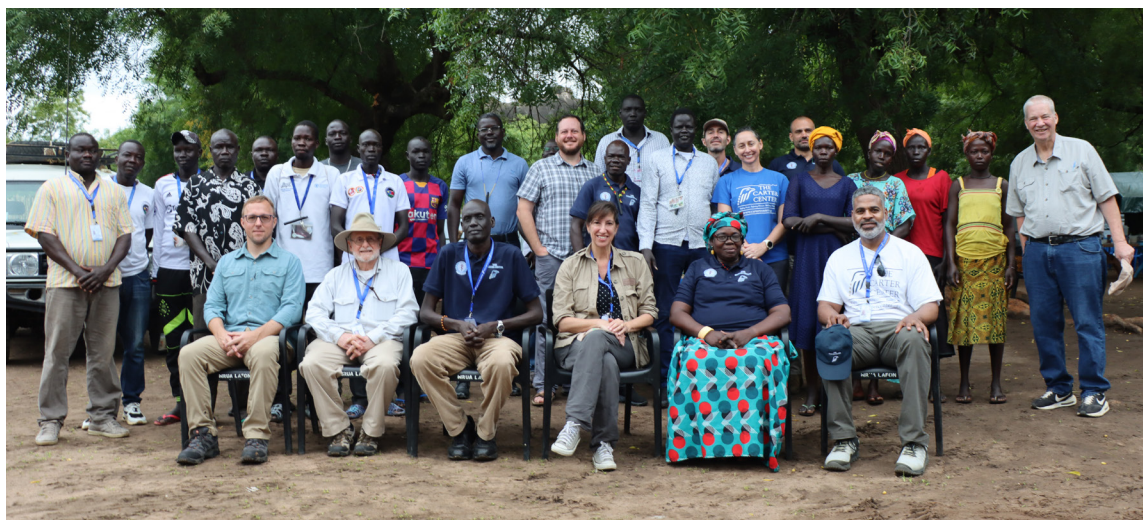
Carter Center Atlanta staff pose alongside South Sudan Trachoma Control Program and Guinea Worm Eradication Program staff in Lafon County, Eastern Equatoria state, South Sudan.

savings. The Carter Center plans to expand trachoma programming and this innovative integrated surgical approach to other regions of South Sudan to ensure that those who need trachoma and cataract services receive care. E