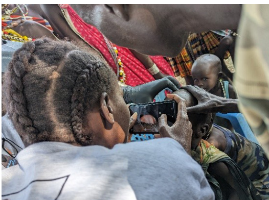
Survey teams capture conjunctival photographs of children in Kapoeta North County, Eastern Equatoria state, South Sudan.

These photographers, in conjunction with the data collection teams, visited 34 communities and worked tirelessly over three weeks to amass a remarkable collection of 7,064 conjunctival photographs. These photos are being shared with the Gondar Grading Center in Amhara, Ethiopia, where certified trachoma graders assess the photos for clinical signs of trachoma. The graded photos will help in completing the research aims of the study, as well as be used to train new cohorts of field graders across the world. E