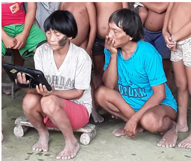
Yanomami women in a focus group in Mavaca community, Venezuela, watch a health education video developed with their communities in mind; they were then asked for feedback on the health messages shown.

Sessions centered on the last transmission area in the region, which spans the border of Brazil and Venezuela in the Amazon Rainforest and is called the Yanomami Focus Area for the predominant nomadic indigenous group living there. About 38,000 people are at risk, comprising 667 communities across about 200,000 square kilometers. That's an average of just 57 people per community and one community per 300 square kilometers of jungle.